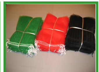
Expand Flat Netting Bags Type