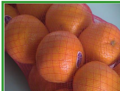
Stiffened Plane Mesh