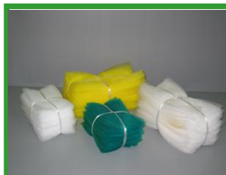
Flat Netting Bags Type