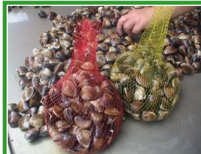
Sea food Nets