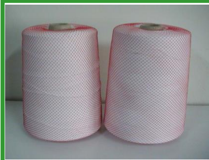
Silk Thread Protection Sleeve