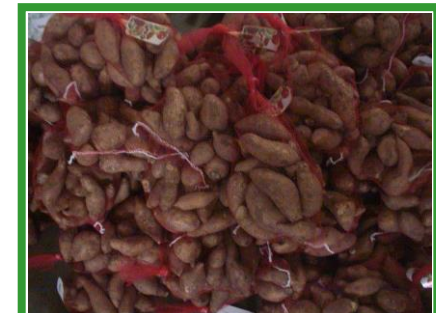
Sweet Potato Nets