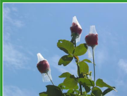
Flower Protection Nets